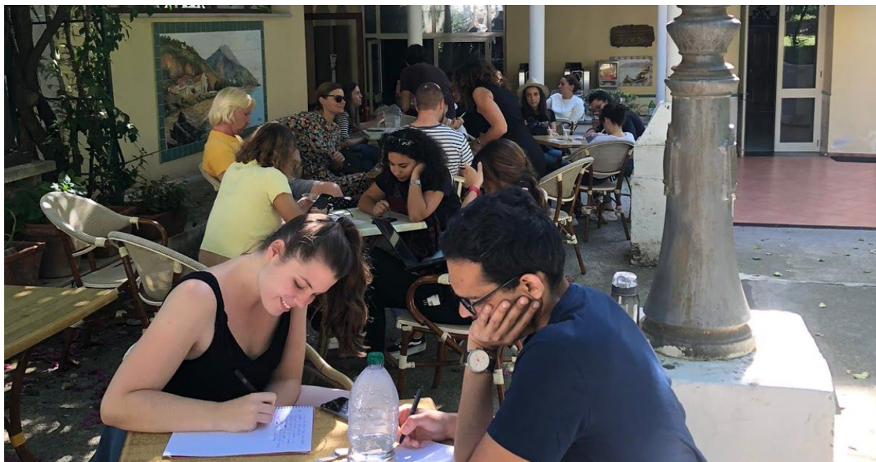
Discussing with the group