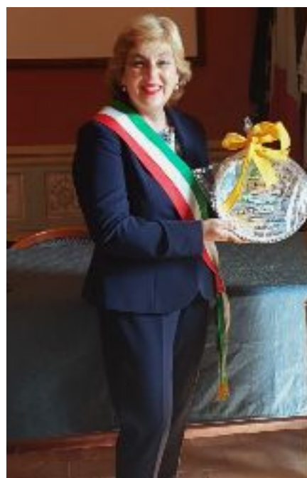
Meeting with mayor's office