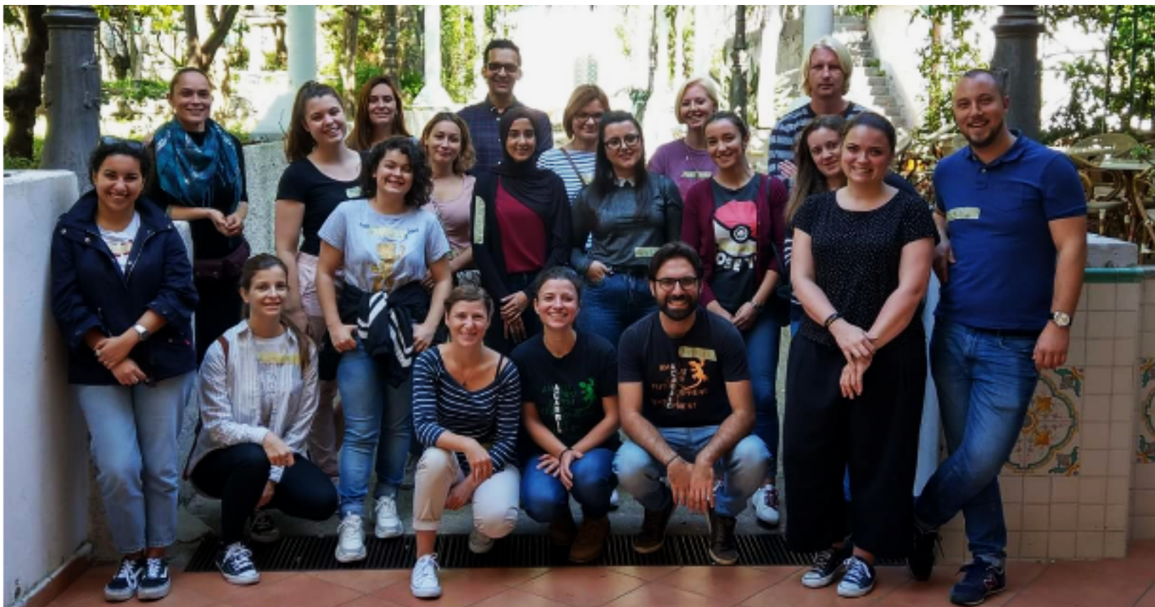
Our group, first photo together