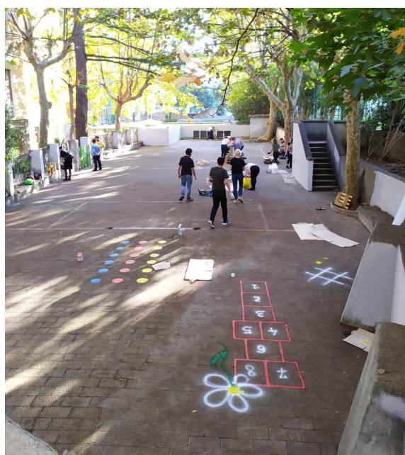
Atmosphere from above