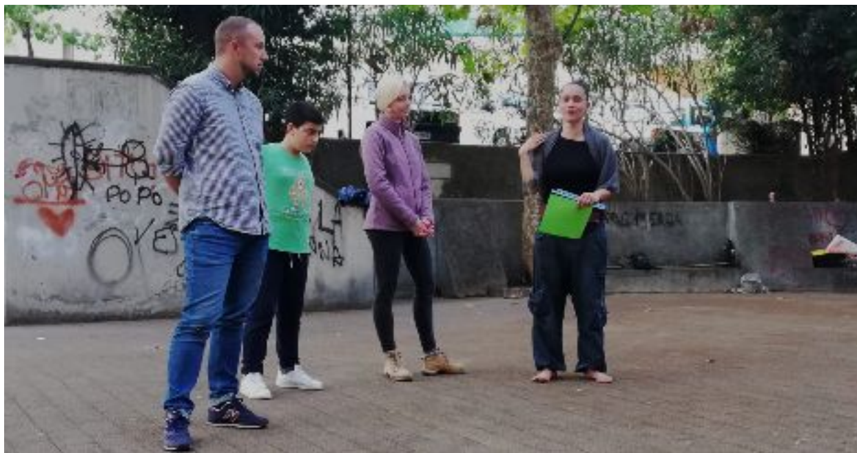
Meeting and discussing with the locals