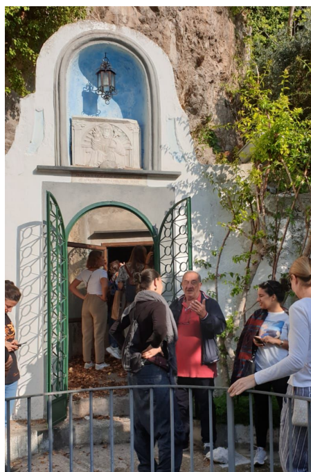
Tour around the convent

Once everyone was familiar with each other, the situation was explained, what we had to do and what did we have for it – objectives and materials. One kid and one Italian speaker per group (so we could smoothly talk with them) all together discussed what were the needs of the local youth and what could we do to satisfy them. So, we all learned one thing: football is the most important thing . Every group's idea was around the same thing: to make it a safe and playable football pitch. Painting the lines, making new gates, balls, etcetera. Lastly, we debated which ideas were doable and which were to much of a fantasy. At the end, we all reached an agreement and finished earlier, as for the next day it would be the hardest and gratifying one.