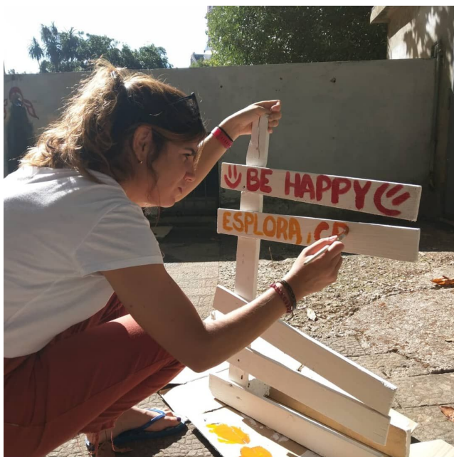
Macarena doing the sign